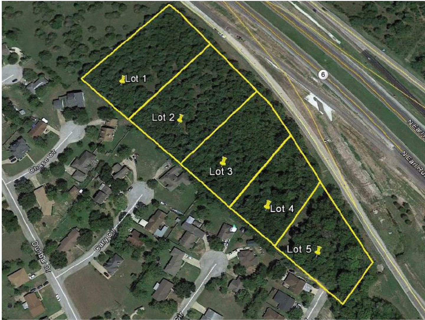
Lot Measurements (Approximate)