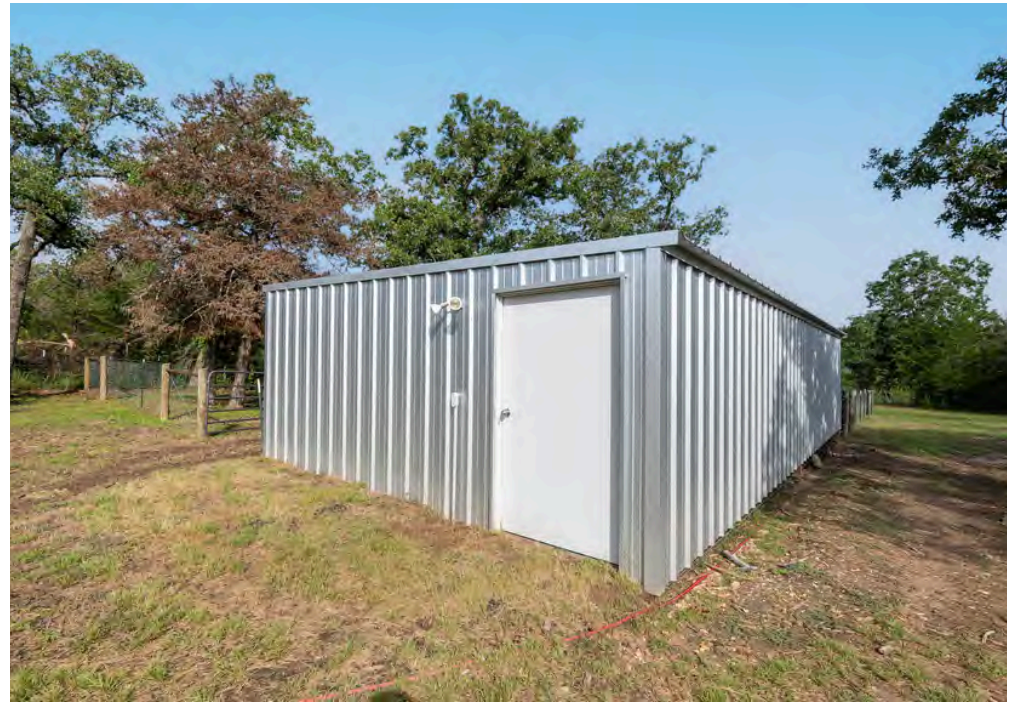
Includes high end security gate, storage building with lean-to on slab, a loafing shed, and a custom-built treehouse for the kids.