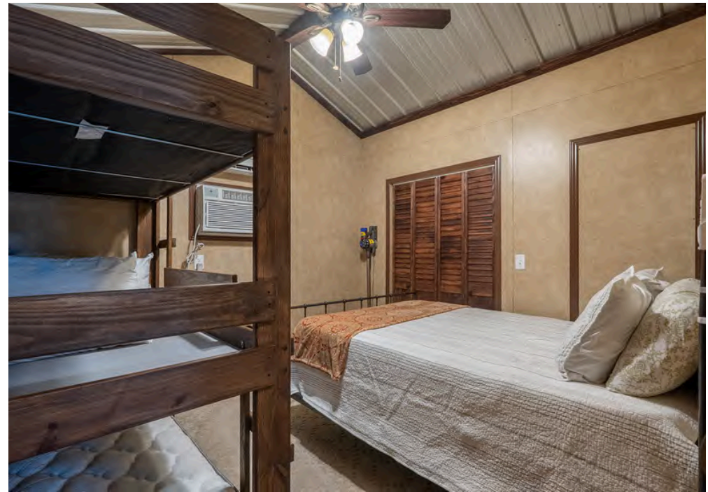
With a front porch overlooking the main pond and surrounding cliffs, this cozy cabin is a perfect weekend retreat or game day house. It includes a full kitchen, restroom, and bunk room. Seller will leave it furnished, excluding the dining table.