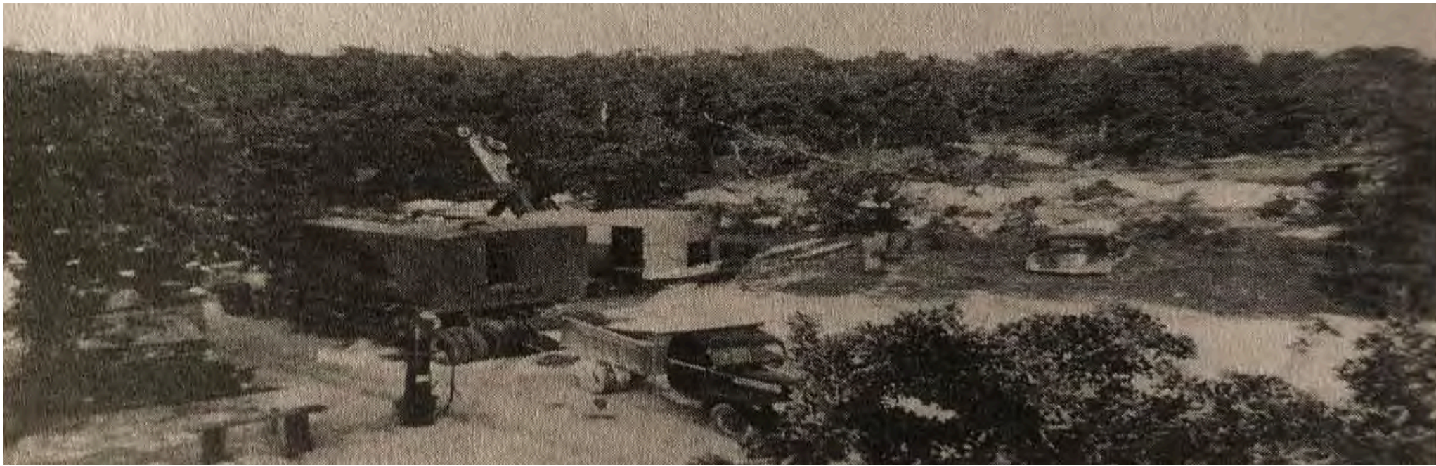
Digging the Clay Pits in the early 1930s